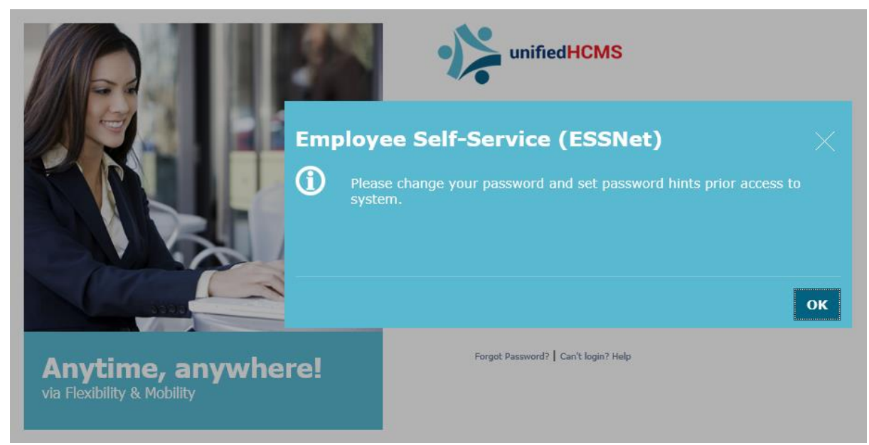
Figure A1.2: First Time Login Prompt

3. Fill in your User ID and Password into the appropriate fields as shown in Figure A1.1 above. Click on the Sign In button to proceed with the login.