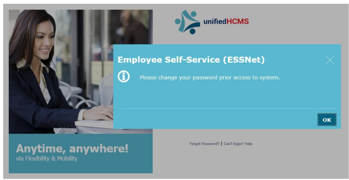
Figure A2.6: Forgot Password – Login After Reset Password Prompt

7. If there is no Hints Policy implemented by your HR, the Forgot Password ? link will not be displayed under the Sign In button as you are not allowed to self-reset your password (as shown in Figure A2.5 above). You are required to consult your HR to reset your password each time you have forgotten your password.